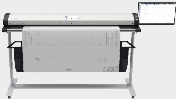
Large documents like maps rewind to the front or fall into the paper catch.