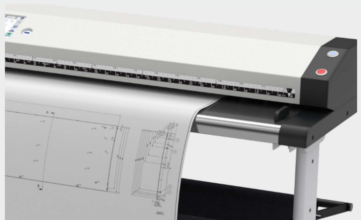
A USB 3.0 port lets you take away your scanned images on a USB device.