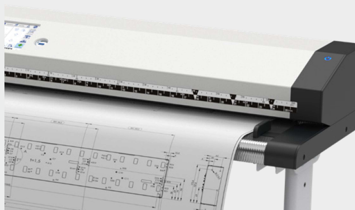
A USB 3.0 port let you take away your scanned images on a USB device.

WideTEK® 48CL-600, a valuable production device for numerous markets