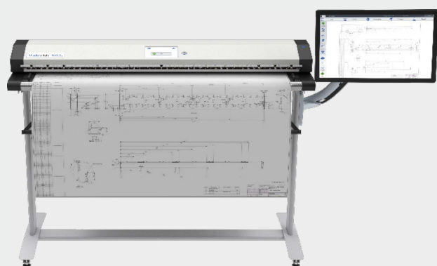
Large documents like maps rewind to the front or fall into the paper catch.

The WideTEK® 48CL produces extraordinarily sharp images, with color accuracy even superior to competing CCD scanners. Document rotation is done on the fly, a scan of an E-sized / A0 document in landscape at 300 dpi in 24bit color takes less than 7 seconds to scan and another 2 seconds to crop & deskew, preview and store.