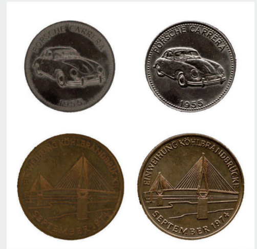
2D scan versus 3D scan, capture all details