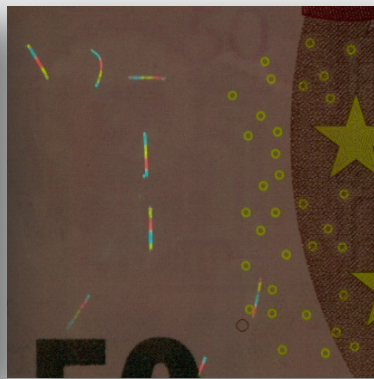
UV-light excites fluorescent ink and fiber