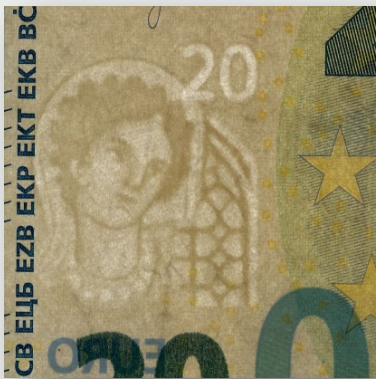
Backlight shows watermarks