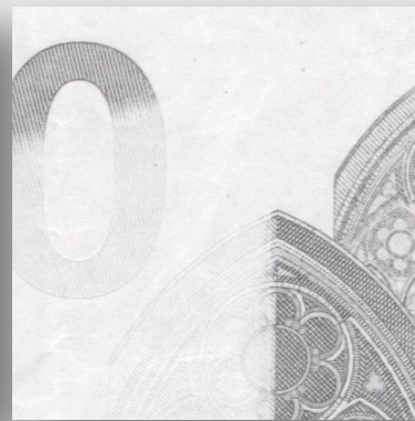
IR-light proves banknote's IR response