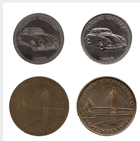
2D scan versus 3D scan, capture all details