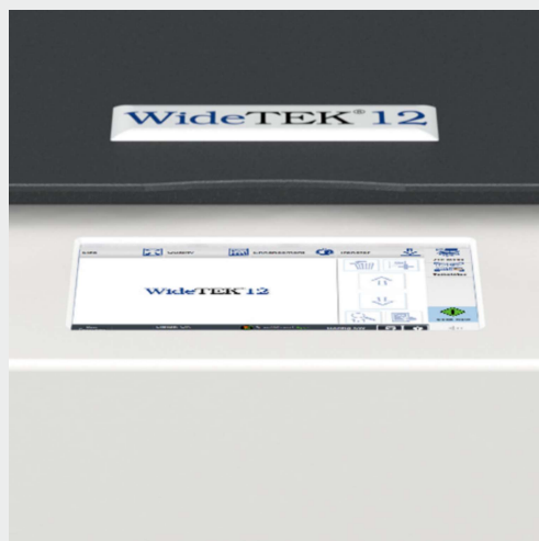
Large color touchscreen for simplified operation