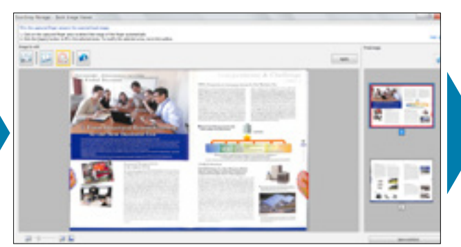
Point retouch function Fingers captured during scanning can be removed.

Book image correction Flattens and corrects curve distortion.