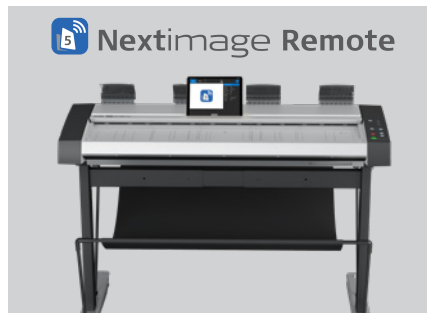
Remote control Nextimage software from your tablet