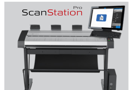
Operate Nextimage software directly on your scanner

Contex solutions are compatible with all leading large-format printers. See the full list at contex.com/nextimage-supported-printers