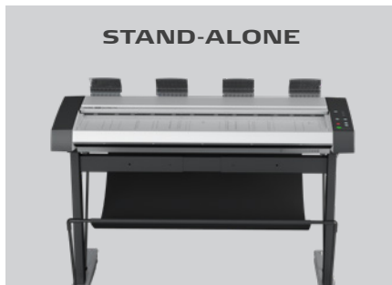
Operate your Nextimage software from a PC separate from the stand