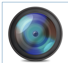
One camera, one perfect image, no stitching