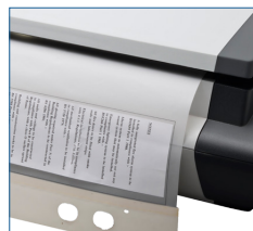
Oversize document scanning

The large flatbed surface provides great flexibility for creativity, careful document handling, oversized and book scanning.