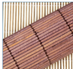
Wood, bamboo and similar