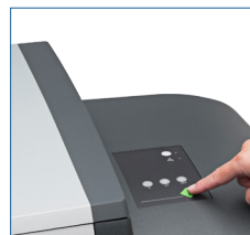
One-touch scanning: The entire image in just 4 seconds