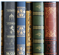
Odd-size items – books