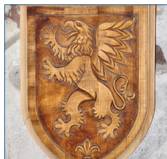
Odd-size materials – carvings