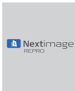
Nextimage REPRO software