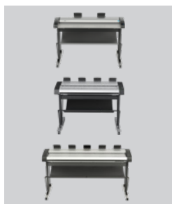
Your choice of scanner IQ Quattro X 44 inches HD Ultra X 42 inches HD Ultra X 60 inches