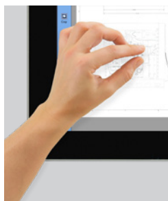
Touchscreen Full HD 21.5" touchscreen