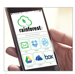
Cloud enabled with rainforest365