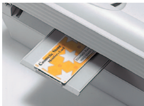
Straight Path for Card Scanning

The DR-2580C scanner also includes the Rapid Recovery System, which sends only completed image data to the application software, offering seamless scanning operation should a feeding error occur. And the Punch Hole Removal function removes the black dots that appear when scanning pages from booklets or binders.