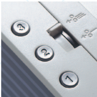
Scan-To-Job Buttons for One-Touch Operation

The DR-2580C scanner is not only one of the smallest and most versatile in its class, but it's also incredibly easy to use.