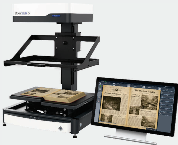
Scanning bound newspapers up to A3 with flat glass plate.

The book cradle ensures perfect scans while protecting the spine. The V-shaped glass plate can be removed in just a few simple steps. Depending on your needs, the BookTEK® 5 V3 Archive Automatic can now be used with an optional flat glass plate or without a glass plate at all.