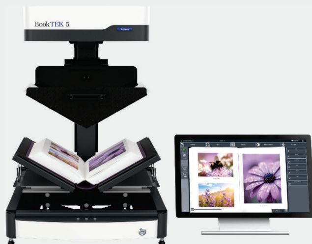
Scanning highly glossy originals with V-shaped glass plate.