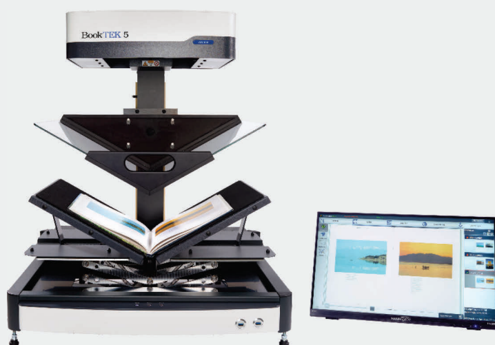
Scanning highly glossy originals with V-shaped glass plate.