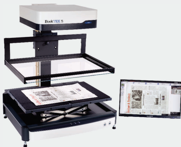
Scanning newspapers up to A2 with flat glass plate.

The book cradle enables perfect scans while protecting the book binding. The V-shaped glass plate can be removed in a few simple steps. Depending on requirements, the BookTEK® 5 V2 Archive can now be used with an optional flat glass plate or without a glass plate at all.