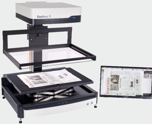
Scanning newspapers up to A2 with flat glass plate.

The book cradle enables perfect scans while protecting the book binding. The V-shaped glass plate can be removed in a few simple steps. Depending on requirements, the Bookeye® 5 V2 Archive can now be used with an optional flat glass plate or without a glass plate at all.