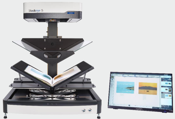
Scanning highly glossy originals with V-shaped glass plate.