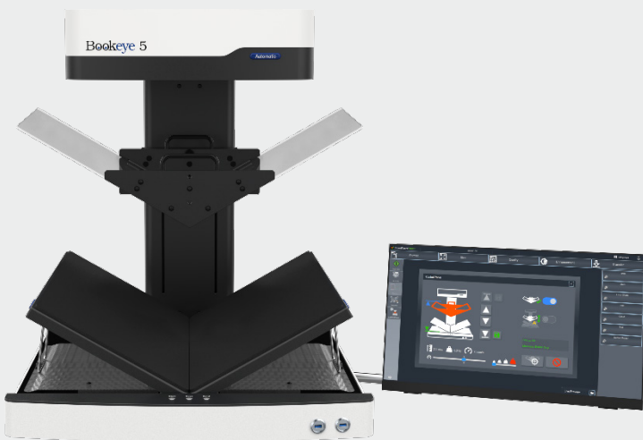
The Bookeye® 5 V2A Automatic with V-shaped book cradle and glass plate.

The V-shaped glass plate is controlled via the ScanWizard's extended user interface. The new control panel with animated function buttons allows, among other things, horizontal movement up and down, setting the speed or the position in which the glass plate remains after the finished scan job. It does not necessarily have to be at the top or bottom. Depending on requirements, the glass plate can be removed and refitted without tools and in two simple steps.