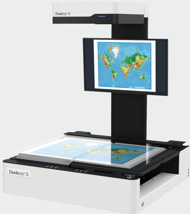
The Bookeye® 5 V1A with V-shaped book cradle and motorized glass plate

Before a new book is scanned, the lift motor lowers the glass plate onto the book until the desired pressure is reached. The pressure is measured highly accurately, and it can be up to 10kg / 22lbs under operator control. Once the book's thickness is programmed into the lift mechanics, the scanner only needs to open and close the scanning glass to allow for book page flipping. The borderless glass plate opens automatically after each scan to the user defined angle. The speed at which the glass plate opens and closes is also user adjustable.