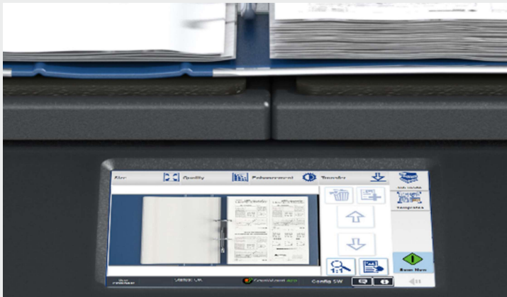
Large 7 inch color touchscreen conveniently located on the front

The Bookeye® 4 V3 Kiosk copier has an integrated billing module. This means that for all applications that do not have an existing card or billing system, Bookeye® 4V3 Kiosk can take over the billing itself. Configurable invoice printing and journaling are standard functions in the Bookeye® 4 V3 Kiosk as well as remote locking and unlocking of the system.