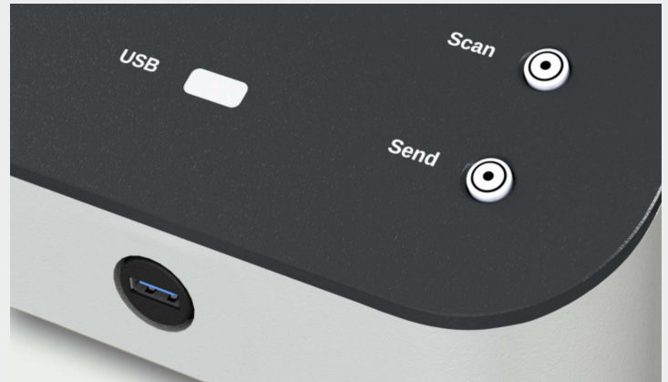
The USB 3.0 port on the front lets you take away your scanned images.