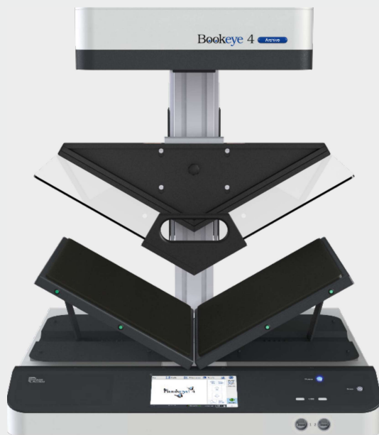
The Bookeye® 4 V2 Professional Archive with V-shaped book cradle and glass plate.

The v-shaped book cradle enables distortion free scans while it also protects the book binding. The balanced design allows effortless scanning without any physical effort. For exact positioning on the book fold, the V-shaped glass plate is moved horizontally. If required, the V-shaped glass plate can be removed without requiring any tools or special technical training.