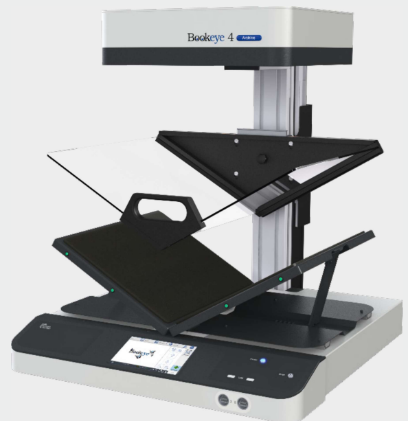
Book cradle in 120° V position.